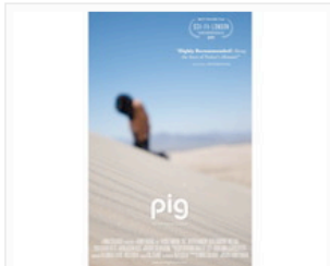
Pig – a great psychological thriller with a surprising end Credits: Poster Ad Art Antic Pictures